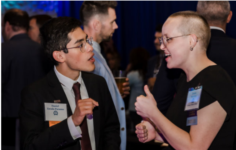
◀ Past and present Zero Hunger Interns connect at the 2023 Hunger Leadership Awards